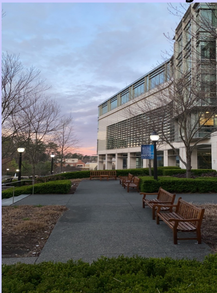
The Mary Duke Biddle Trent Semans Center for Health